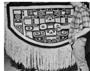
Chilkat #4 One of the original blankets created in the lodge. Originally used only for brotherhood ceremonies. Missing since '65 ***MISSING***