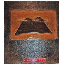
Carved Plaque MKP