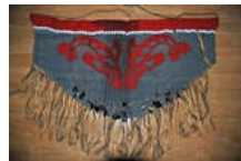
Diving Whale Apron