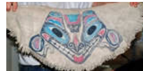
Leather Bear Cape