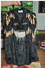
Lummi Power Shirts Used in the Spirit of S'lahal Dance Size M Replaced originals that were retired.