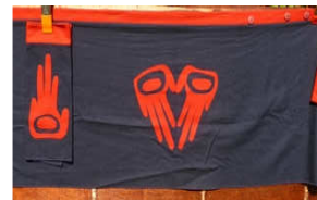
Apron for and leggings Ocean Set: Oyster. Blue wool, red wool fabric, leather fringe, shell buttons.