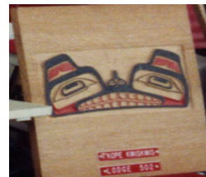
Carved T'Kope Kwiskwis Plaque ***MISSING***