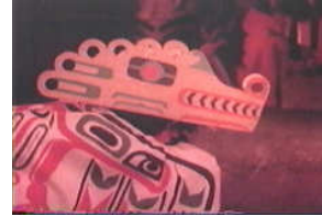
Lightning Snake Headdress #3 Used in Lightning Snake Dance