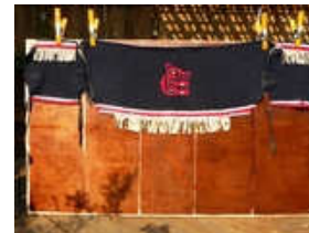
Apron and two leggings for Sheppard Set: Wolf. Blue wool, leather fringe, red wool fabric, plastic buttons.