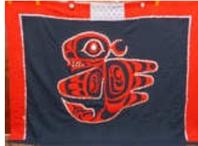
Ocean Set: Three Finned Orca Allowat Sakima blanket, blue wool, red wool fabric, shell buttons. Features mystical three finned Orca.

Year: 2008 Designer: Case Barden Sewing: Carolyn Barden