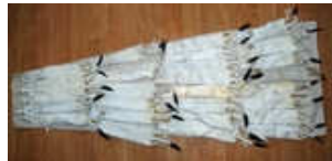
Long Ermine Train