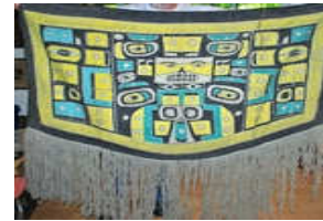
Chilkat #1 One of the original blankets created in the lodge. Originally used only for brotherhood ceremonies.