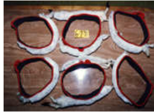
Various Ermine Headbands