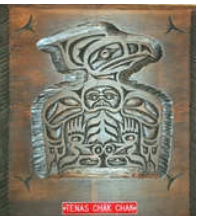
Carved Plaque TCC