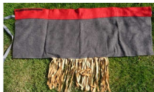
Grey Blank Apron with Velcro and string attachments with fringe