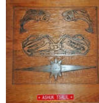
Carved Plaque AST