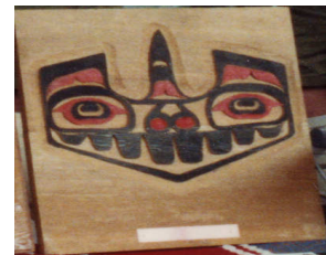
Carved SCW Plaque ***MISSING***