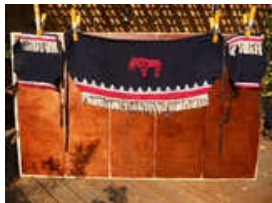
Apron and two leggings for Sheppard Set: Mountain Goat. Blue wool, leather fringe, red wool fabric, plastic buttons.