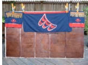
Apron and leggings for Ocean Set: Three Finned Orca. Blue wool, red wool fabric, leather fringe, shell buttons.

Year: 2008 Designer: Case Barden Sewing: Carolyn Barden