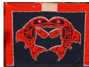
Ocean Set: Happy Salmon Need Better Photo

Year: 2008 Designer: Case Barden Sewing: Helen Young