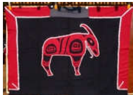
Sheppard Set: Mountain Goat Meteuk blanket, blue wool, red wool fabric, plastic buttons. Features Mountain Goat.