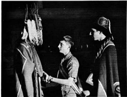
The Vision of the T'Kope Kwiskwis Ceremony Team as adopted in 2003:

We have been extremely lucky as a lodge to have been given gifts of dances, songs and stories by their native owners. To our knowledge no other lodge in the nation are custodians of similar gifts. We must remember to respect these gifts and honor those who gave them to us so that future generations of arrowmen may learn to treasure them.