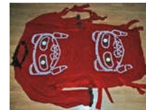
Red Dance Shirt