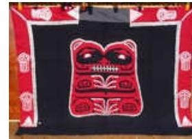
Sheppard Set: Bear Allowat Sakima blanket, blue wool, red wool fabric, plastic buttons. Features Bear the symbol of Sheppard.