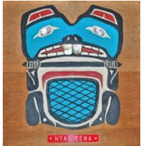
Carved Plaque HEN