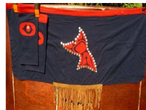
Apron for and leggings Ocean Set: Happy Salmon. Blue wool, red wool fabric, leather fringe, shell buttons.

Year: 2008 Designer: Case Barden Sewing: Helen Young