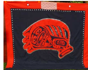
Ocean Set: Oyster Need Better Photo

Year: 2008 Designer: Case Barden Sewing: Carolyn Barden