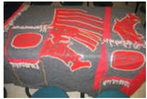
Hyas Eena Set: Eagle & Salmon Allowat Sakima blanket, grey blanket, red wool fabric, shell buttons.