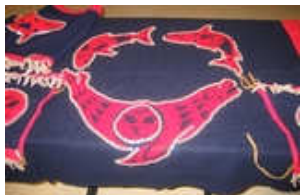
Hyas Eena Set: Seal and Salmon