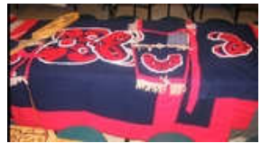
Hyas Eena Set: Bear