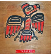
Carved Plaque YAK