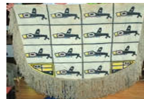
Chilkat #3 Replica of "Chief's Shaiks" One of the original blankets created in the lodge. Originally used only for brotherhood ceremonies.