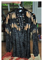
Lummi Power Shirts Used in the Spirit of S'lahal Dance Size M Replaced originals that were retired.