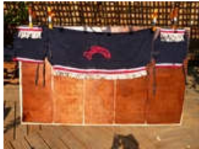
Apron and two leggings for Sheppard Set: Double Salmon. Blue wool, leather fringe, red wool fabric, plastic buttons.