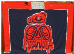
Ocean Set: Osprey Need Better Photo

Year: 2008 Designer: Case Barden Sewing: Beth Carter