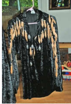
Lummi Power Shirts Used in the Spirit of S'lahal Dance Size L Replaced originals that were retired.