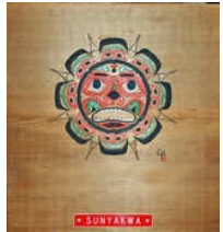
Carved Plaque SUN