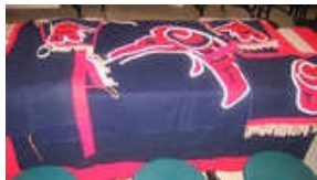
Hyas Eena Set: Raven