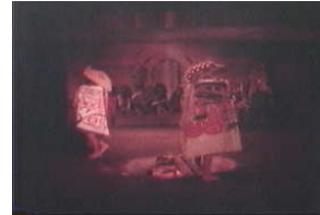
Lightning Snake Headdress #4 Used in Lightning Snake Dance