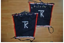
Leggings Matching Leggings for the TK blanket