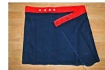
Eight Blue Blank Aprons with button attachments