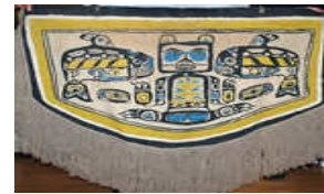
Chilkat #2 "Bear Mother" One of the original blankets created in the lodge. Originally used only for brotherhood ceremonies.