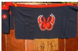
Apron and leggings for Ocean Set: Osprey. Blue wool, red wool fabric, leather fringe, shell buttons.