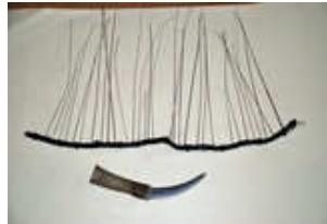
Replica Walrus Whiskers for Chief's Headdress and bone knife for BH ceremony