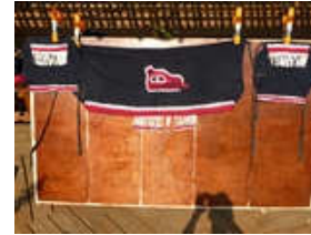
Apron and two leggings for Sheppard Set: Bear. Blue wool, leather fringe, red wool fabric, plastic buttons.