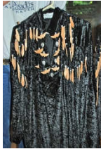
Lummi Power Shirts Used in the Spirit of S'lahal Dance Size L Replaced originals that were retired.