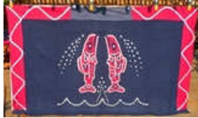
Sheppard Set: Double Salmon Kitchkinet blanket, blue wool, red wool fabric, plastic buttons. Features double salmon jumping out of water.